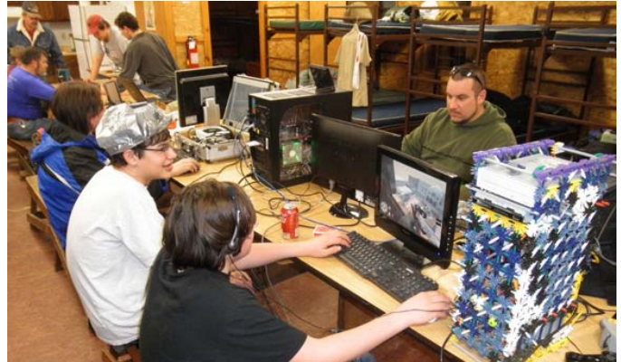
Game night: video & board games