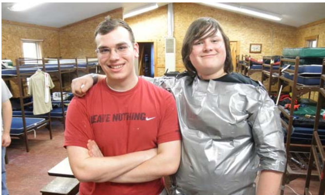
Wilawi Winter Fellowship: Duct tape challenge — body armor