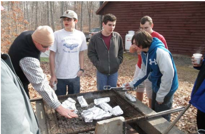
Foil meals at lunch